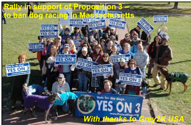
Rally in support of Proposition 3 – to ban dog racing in Massachusetts