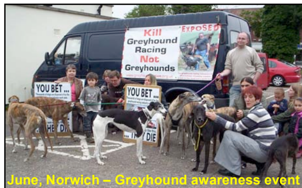
June, Norwich - Greyhound awareness event