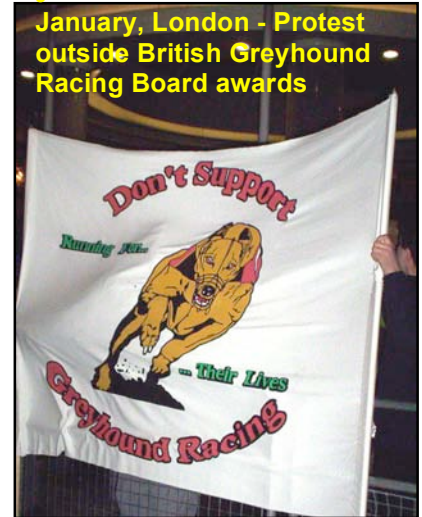
January, London - Protest outside British Greyhound Racing Board awards

The British Greyhound Racing Board announced that attendances at dog tracks had fallen by a further 4.1% (a reduction of 17.5% since 2001).