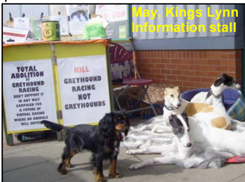
May, Kings Lynn Information stall

Thank you so much to all our supporters for making it a greyt 2008. Let's not forget though, that with over 25,000 greyhounds still being "put down" every year, because of commercial dog racing in the UK and Ireland, we still have a long way to go. Please continue to help us put an end to the evil racing industry, so we can save them all.