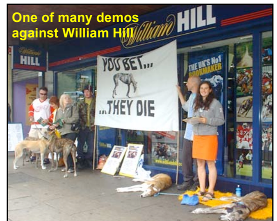
One of many demos against William Hill

Demos and info stalls have been held throughout the country in support of the campaign.