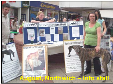
August, Northwich – Info stall