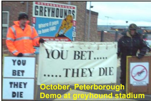
October, Peterborough Demo at greyhound stadium