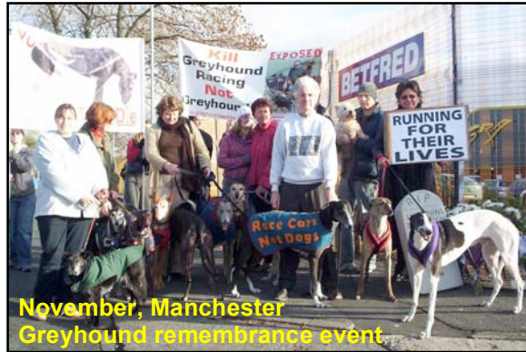
November, Manchester Greyhound remembrance event