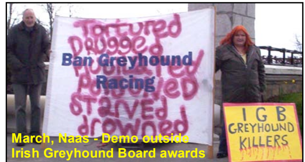
March, Naas - Demo outside Irish Greyhound Board awards

In the Irish Republic dog track attendances fell by 11%, with profits down 10% from 2007 levels.