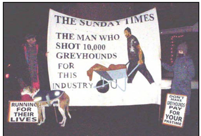
December – Demo outside Coventry Stadium Regular protests and leafleting have driven the dog track there to the brink of closure

The GRA, who also run Wimbledon, Portsmouth and Hall Green (Birmingham), are reported to be experiencing serious financial difficulties, with latest figures showing that the six tracks had collectively seen attendances drop by 10% and restaurant bookings down by 9.9% in 2007.