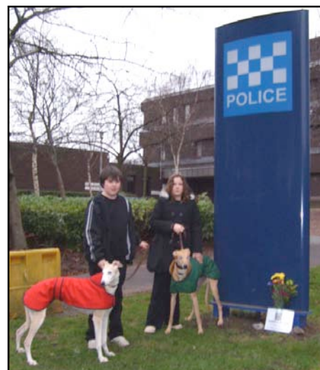
January – Dalkeith, Scotland Flowers laid in memory of ex-racer Bushmills Major, who died two years ago, due to police negligence, after being abandoned at the local police station by his trainer

Greyhound Action, PO Box 127, Kidderminster, DY10 3UZ 01562 700 043 info@greyhoundaction.org.uk www.greyhoundaction.org.uk