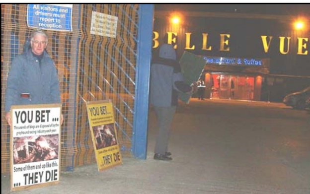
December – Weekly demo/leafleting at Belle Vue, where the number of races has been reduced

As expected, the GRA (Greyhound Racing Association) were forced to cut their losses and announced that Oxford would close on Tuesdays from January, claiming they were constantly losing money on the midweek meeting. Another of their stadiums, Birmingham's Perry Barr, also cut its midweek racing and a third, Belle Vue in Manchester, reduced the number of races it was staging at each meeting.