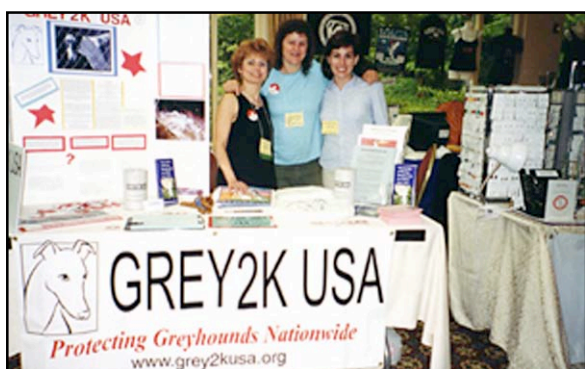
Greyhound protection group Grey2K USA educating the public in Washington DC

The state of Alabama once raked in millions from tax on pari-mutuel betting at its four greyhound tracks, but last year's proceeds dropped 10% over 2007, due to declining interest in dog racing.