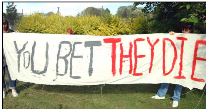
Recent demo outside "struggling" Brighton & Hove