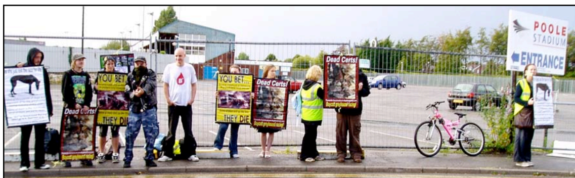
One of several recent demos outside Poole Stadium and an info stall in the town centre

Yet another greyhound track, this time at Poole, is facing regular demos by local Greyhound Action supporters, following the formation of a new GA branch in Dorset. The branch also plans to hold info stalls in Poole town centre and other locations throughout the county. If you live in the area and would like to help the campaign, call Dorset Greyhound Action on 07952 115771.