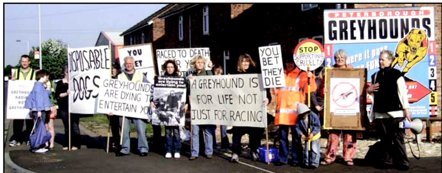
Demo, Peterborough Stadium, May 24 th