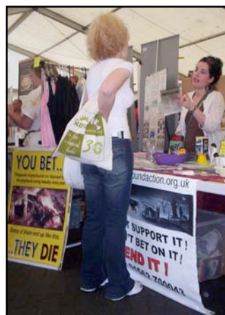
Stall, Bristol Vegan Fayre, May 31 st