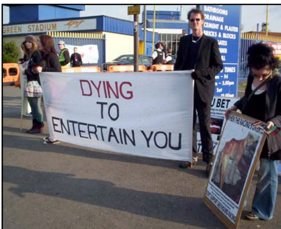
Launch of campaign to close dog track at Hall Green Stadium, Birmingham, May 24 th