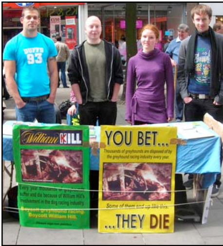
Street stall, Sheffield, May 24 th

This year's Greyhound Awareness Week (May 24 th - 31 st ) was, once again, a great success, with demos, street stalls and other events being held throughout the country to educate the public about the plight of greyhounds and encourage them not to attend or bet on greyhound racing.