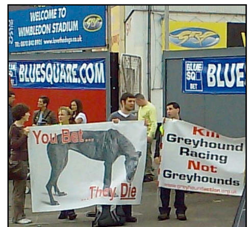
Demo, Greyhound Derby Final, Wimbledon Stadium, London, May 31 st