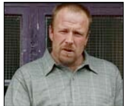
Evil - Andrew Gough

The track's closure leaves just one greyhound stadium in Wales, where at one time there were at least half a dozen.