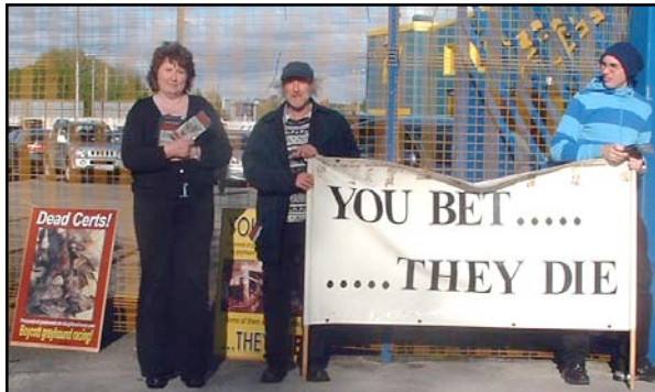
May – Belle Vue Stadium, Manchester