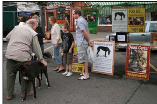
June – Grantham town centre