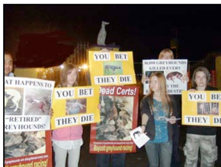
September – Lifford Stadium, Ireland