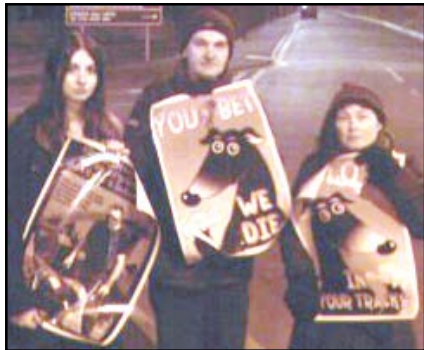
February – Nottingham Stadium