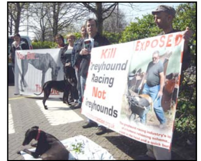
April – Hove Stadium