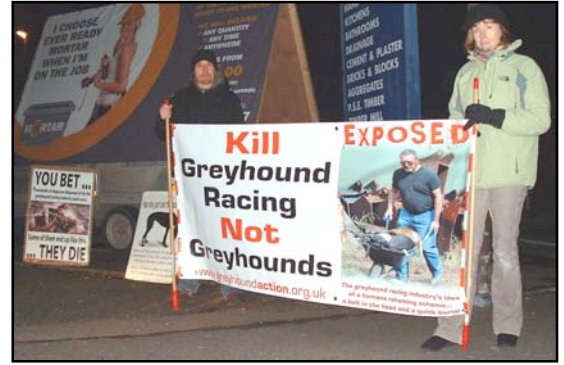
January – Hall Green Stadium, Birmingham

These photos give just a small indication of this year's efforts to protect greyhounds from suffering and slaughter. Let's do it again in 2010!