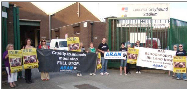
August – Limerick Stadium, Ireland