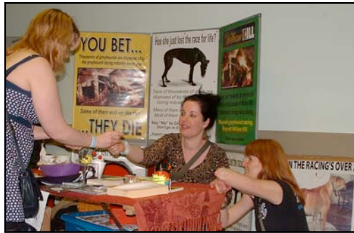
March – Brighton Vegan Fayre