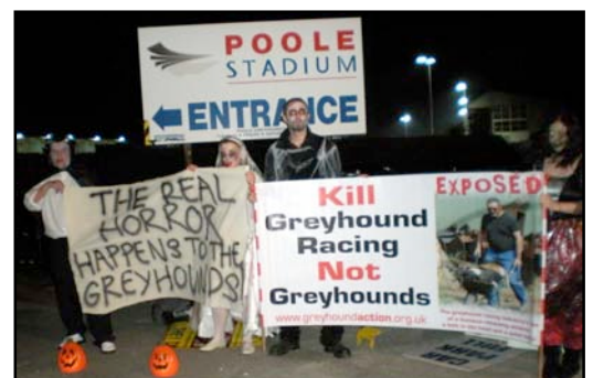
October – Halloween, Poole Stadium