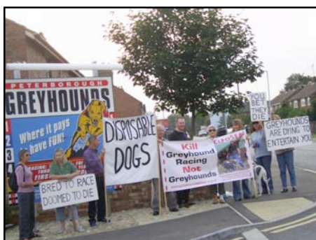
September – Peterborough Stadium