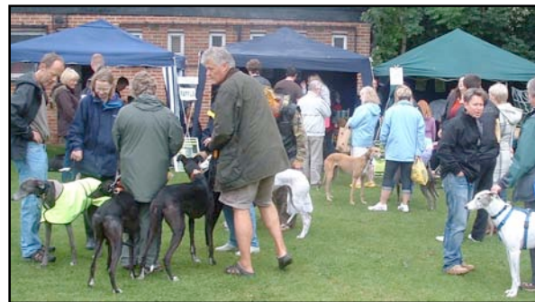
Above and left, July - Greyhound Gathering, Bristol