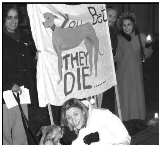
Previous candlelit vigil, outside Walthamstow Stadium

Greyhound Action will, once again, be supporting International Animal Rights Day, which falls on Monday, December 10 th , by holding candlelit vigils outside greyhound tracks on the Saturday prior to this date.