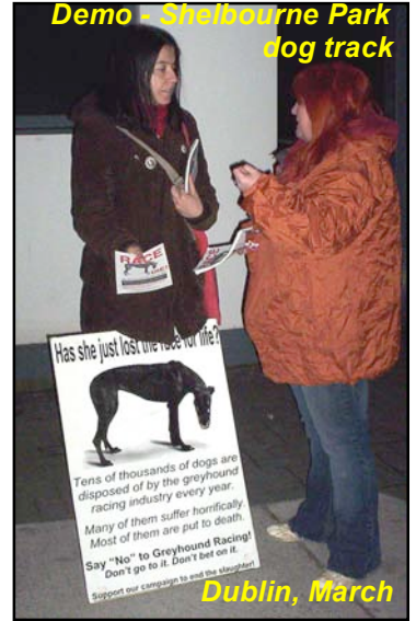
Demo - Shelbourne Park dog track

Our efforts to get media coverage for the plight of greyhounds continue to prove successful, with many articles and letters, critical of the greyhound racing industry, appearing in newspapers throughout the country and interviews with Greyhound Action representatives broadcast regularly on local radio stations.