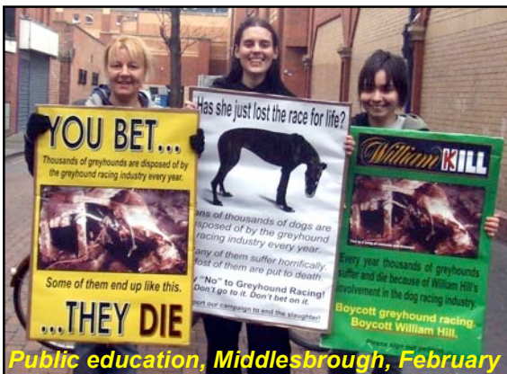
Public education, Middlesbrough, February