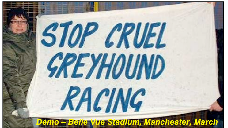
Demo - Belle Vue Stadium, Manchester, March