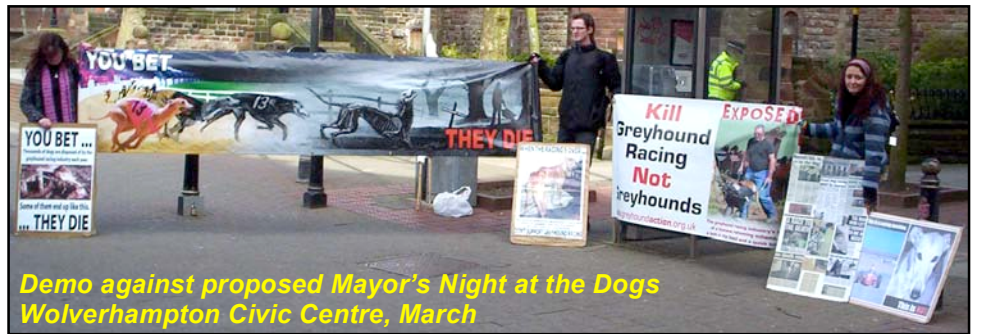
Demo against proposed Mayor's Night at the Dogs Wolverhampton Civic Centre, March