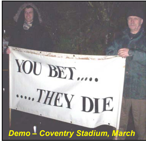
Demo - Coventry Stadium, March