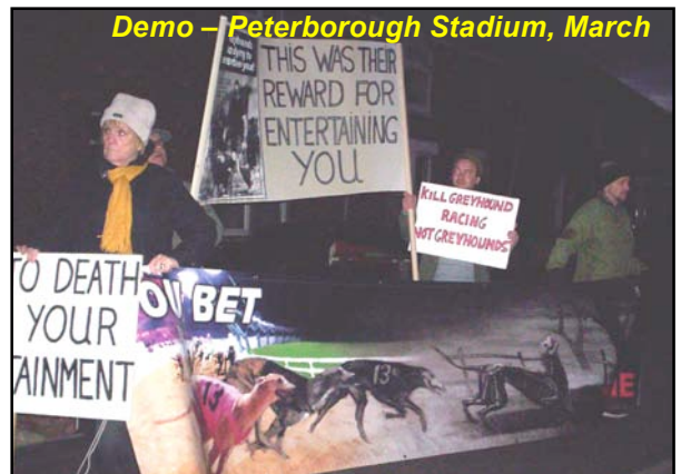
Demo - Peterborough Stadium, March