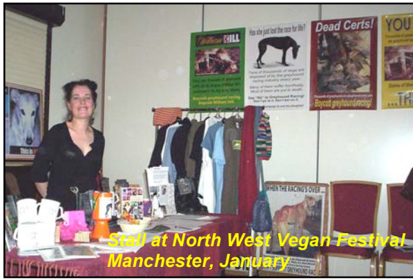
Stall at North West Vegan Festival Manchester, January