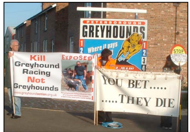
A recent demo outside Peterborough Stadium