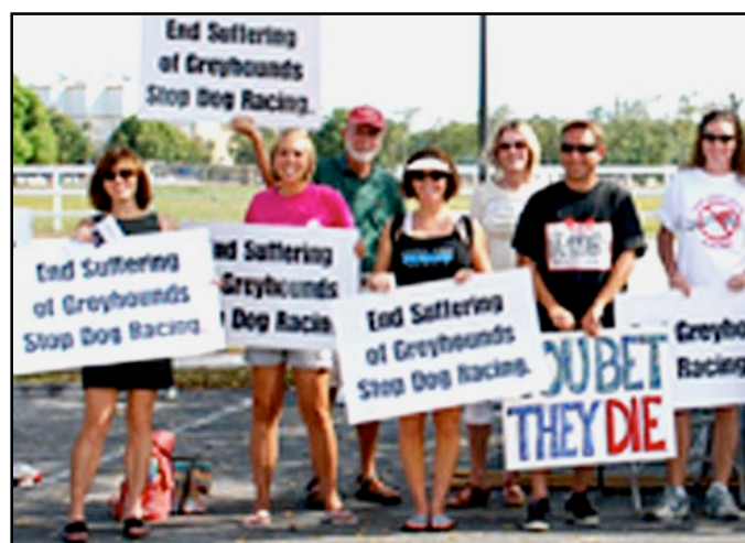
Florida – demo by 40 members of Grey2K USA outside the Naples-Fort Myers greyhound track in Bonita Springs in April

◆ Earlier this year, US greyhound protection activists led a successful campaign to prevent the introduction of commercial dog racing to Jamaica .