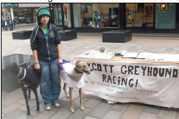
Greyhound Action in the North-East Info stall in Middlesbrough city centre

Attendances at the track have also been hit by continuing revelations about the serious injury and slaughter of dogs racing at the stadium, which are outlined in a special leaflet regularly distributed in Peterborough town centre and outside the stadium by local Greyhound Action supporters.